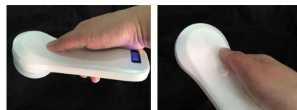
With Scan Key on Probe