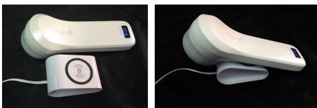
Wireless Charge (also can charge by USB cable)