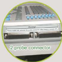
2 probe connector