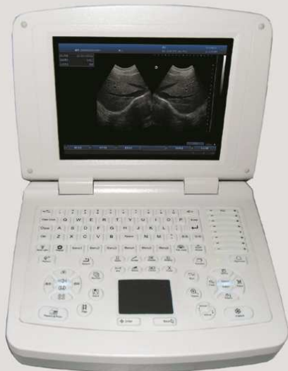
Can change to silicone waterproof keyboard, easy to clean and disinfect